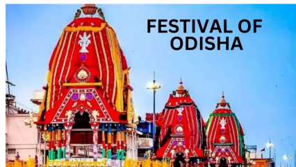
FESTIVAL OF ODISHA